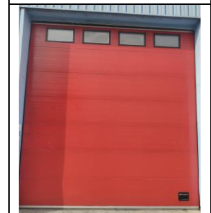
Treated with: MPS REFRESH . After rubbing in once.