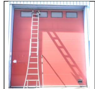
Sectional industrial door, 12 years old, cleaned.